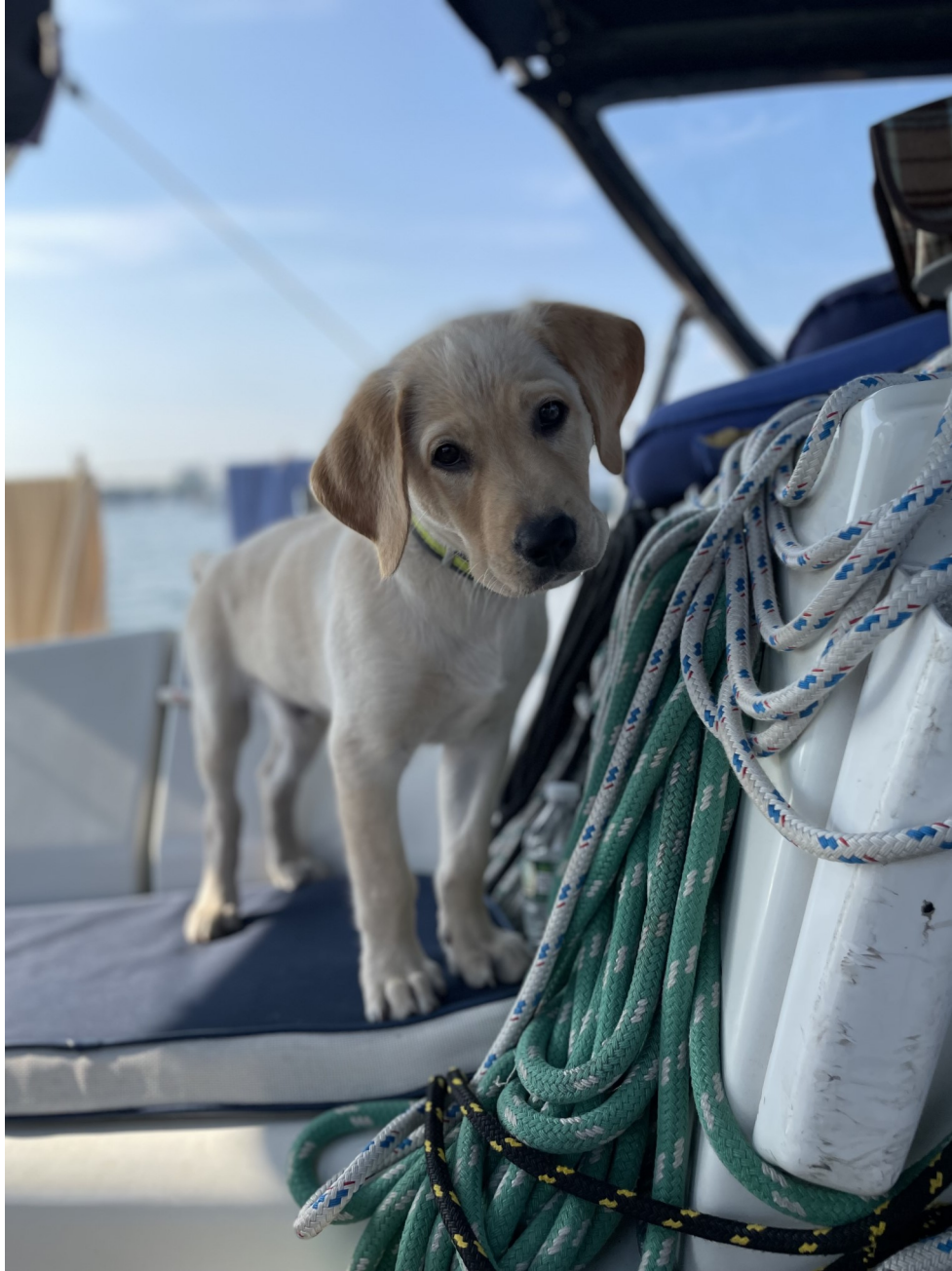
Boat Dog of the Month!